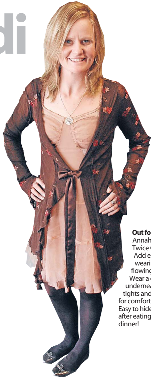
Out for dinner: Annah S Blink Twice Cardi $220 Add elegance by wearing this long flowing cardi. Wear a dress underneath with tights and flat shoes for comfort. Easy to hide your waist after eating too much at dinner!

"Different textures, lengths and colours have brought the once-daggy cardigan into the 21st century," she says.